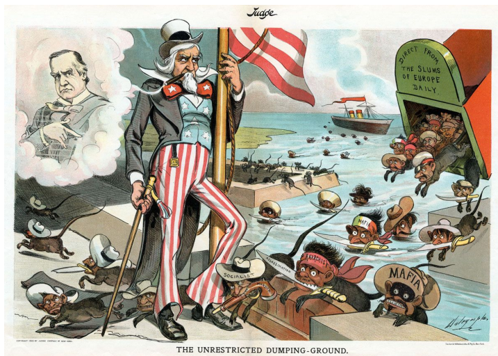
“The Unrestricted Dumping-Ground,” 1902