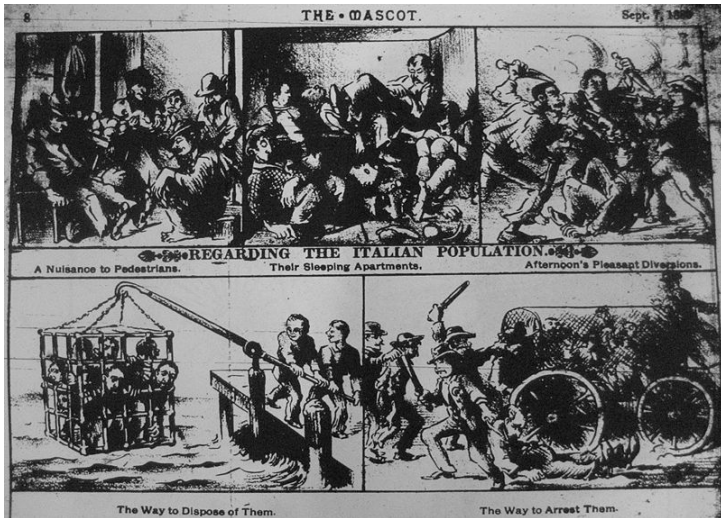
Political cartoon of the stereotypical “drunken Irishman,” c. 1890