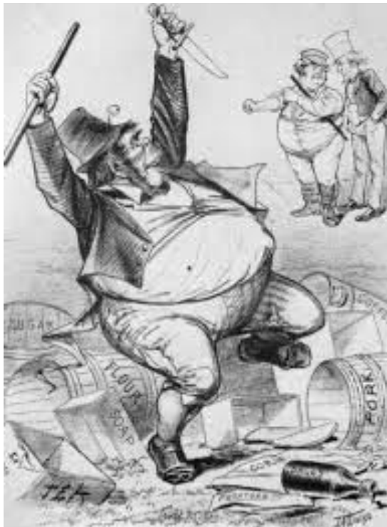
Political cartoon depicting the Irish immigrant, c. 1880s