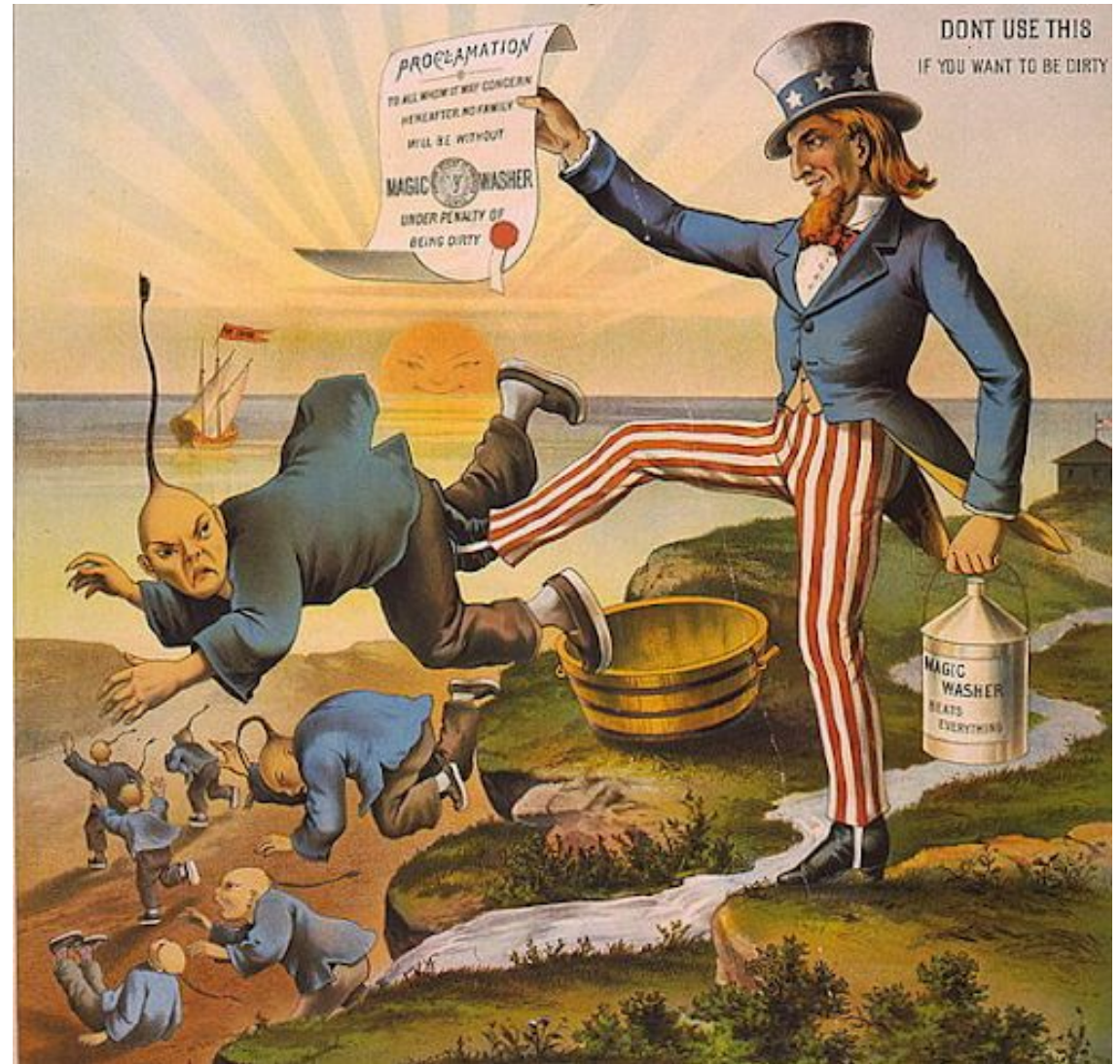
“The Magic Washer,” 1882