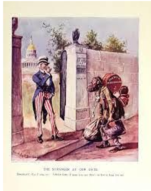
"The Stranger at Our Gate," 1905